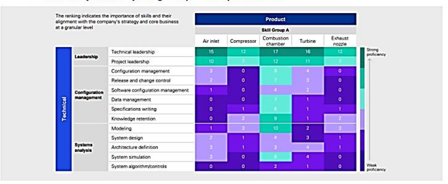
Exhibit 3. Completed sample engineer proficiency assessment

This proficiency assessment for engineers differs from a traditional performance or skill assessment because it 1) Clearly defines the proficiency levels, 2) Contextualizes skills, and 3) Forces the evaluator to distinguish between average performers.