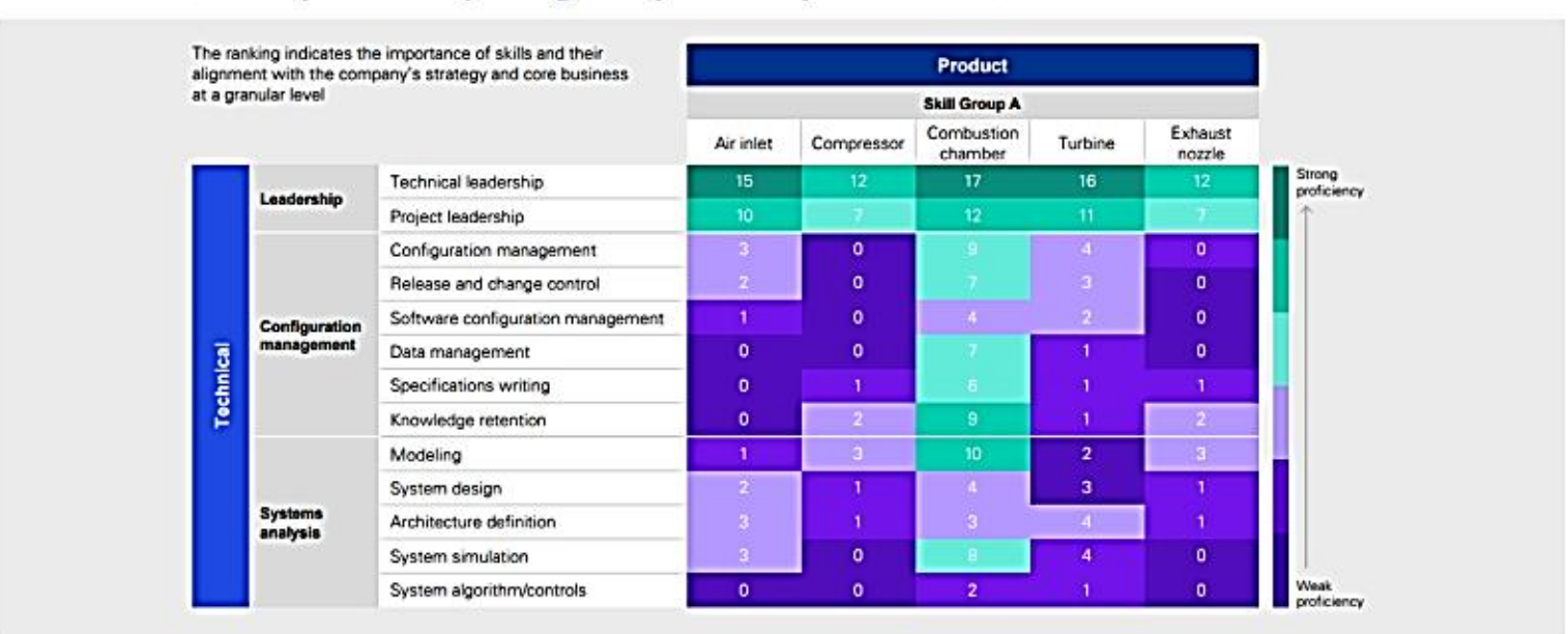
Exhibit 3. Completed sample engineer proficiency assessment

This proficiency assessment for engineers differs from a traditional performance or skill assessment because it 1) Clearly defines the proficiency levels, 2) Contextualizes skills, and 3) Forces the evaluator to distinguish between average performers.